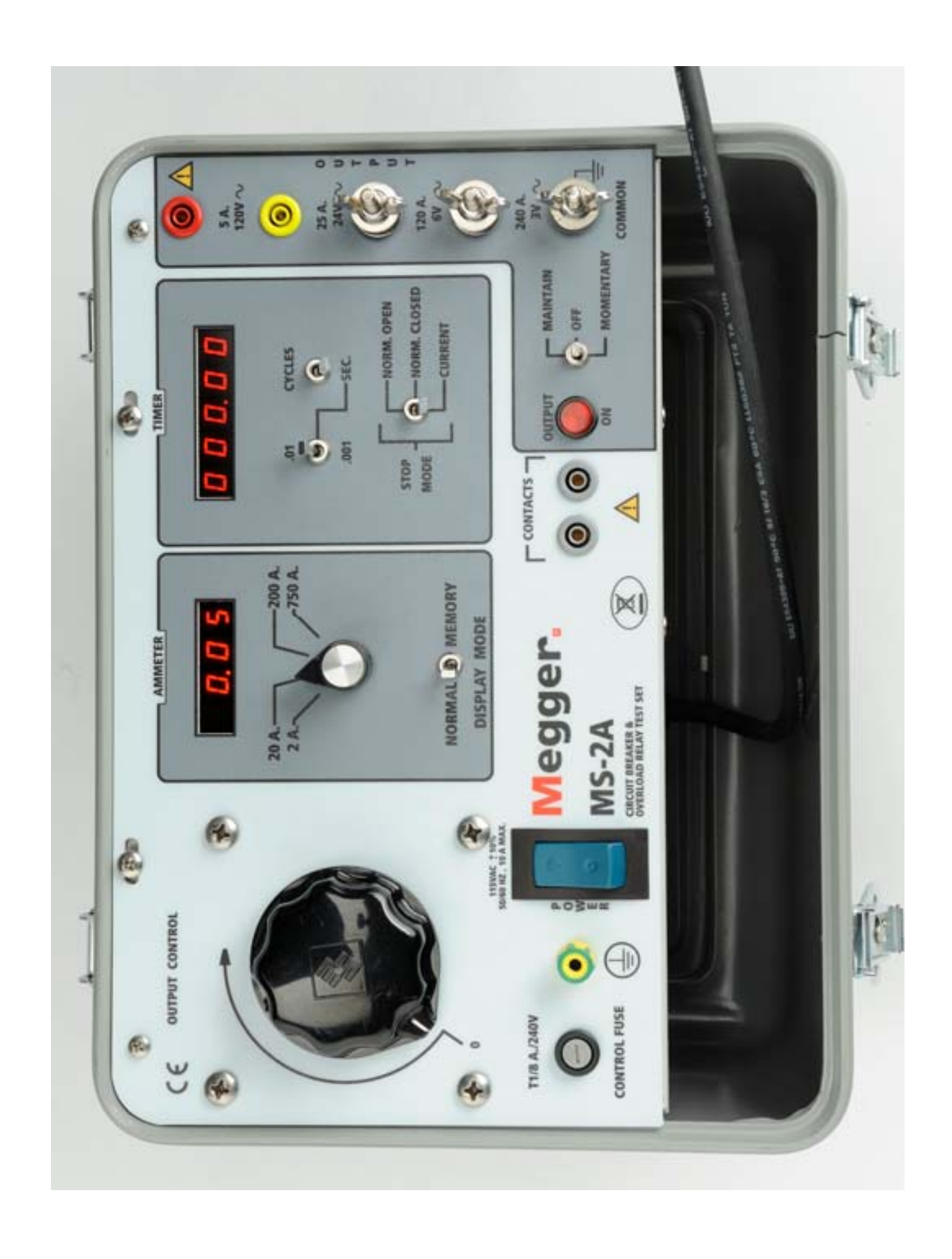
MS-2A Control Panel Figure 1