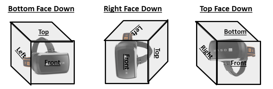
Figure 3: Headset Orientation Example

b. Orient the device so that it is sitting on each face of the cube sequentially. For example, start with the device positioned normally (bottom face of the cube down). Then orient it so that the right side of the cube is facing down. Then continue through the rest of the faces of the cube. See Figure 3 for an example.