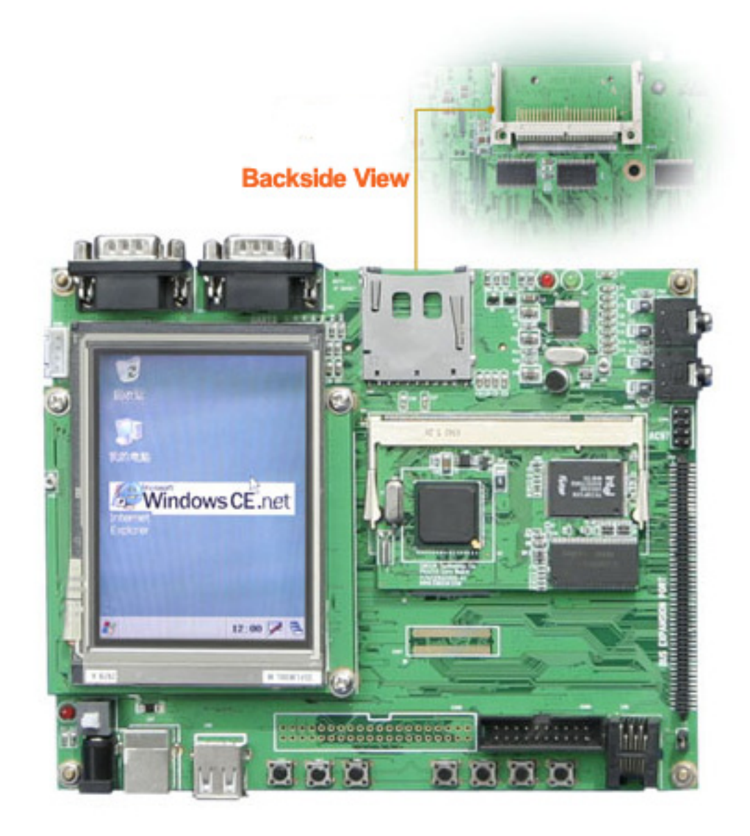
Embest XScale PXA255 Evaluation Board