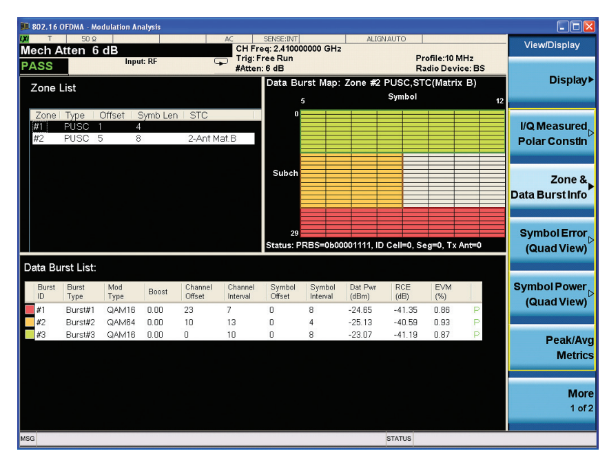
Figure 1. Single-Input pilot-based EVM measurement of matrix B signal.

The Mobile WiMAX measurement application is just one in a common library of more than 25 measurement applications in the Keysight X-Series. The Keysight X-Series is an evolutionary approach to signal analysis that spans instrumentation, measurements and software. The X-Series analyzers, with upgradeable CPU, memory, disk drives, and I/O ports, enable you to keep your test assets current and extend instrument longevity. Proven algorithms, 100% code-compatibility, and a common UI across the X-Series create a consistent measurement framework for signal analysis that ensures repeatable results and measurement integrity so you can leverage your test system software through all phases of product development. In addition to fixed, perpetual licenses for our X-Series measurement applications, we also offer transportable licenses which can increase the value of your investment by allowing to you transport the application to multiple X-Series analyzers.