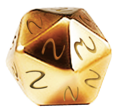
Figure 2. A multi-sided die with a "glitch" on just one side

In this example we effectively have a 50,000-sided die-as you might try to imagine by referring to the multi-sided die shown in Figure 2-that has a waveform anomaly on just one side. The odds of capturing a glitch once after just one acquisition are just 1 part in 50,000, and the odds of not capturing the glitch are 49,999 parts in 50,000.