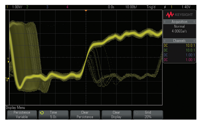
Figure 3: The Keysight MSO/DSO3000 X-Series oscilloscope reliably captures the infrequently occurring metastable state while updating at 1,000,000 waveforms per second.