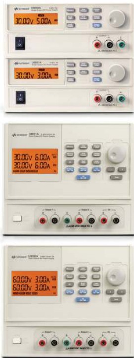
U8001A, U8002A, U8031A, U8032A