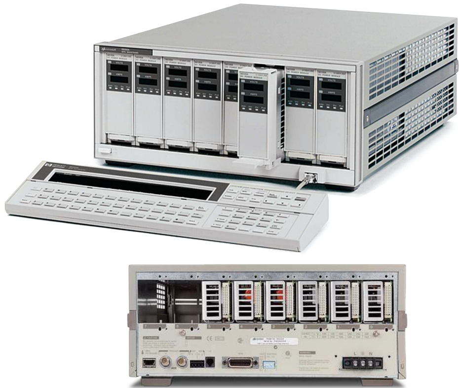
66000 modular power system mainframe