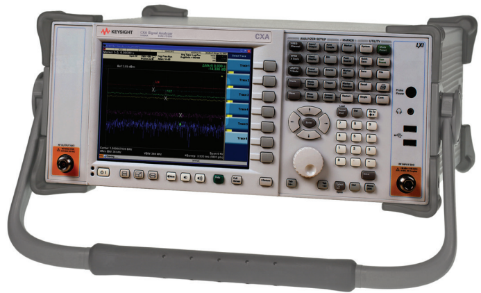
Portable configuration includes pivoting carrying handle and protective corner rubber guards (front protective cover comes standard) – N9000A-PRC