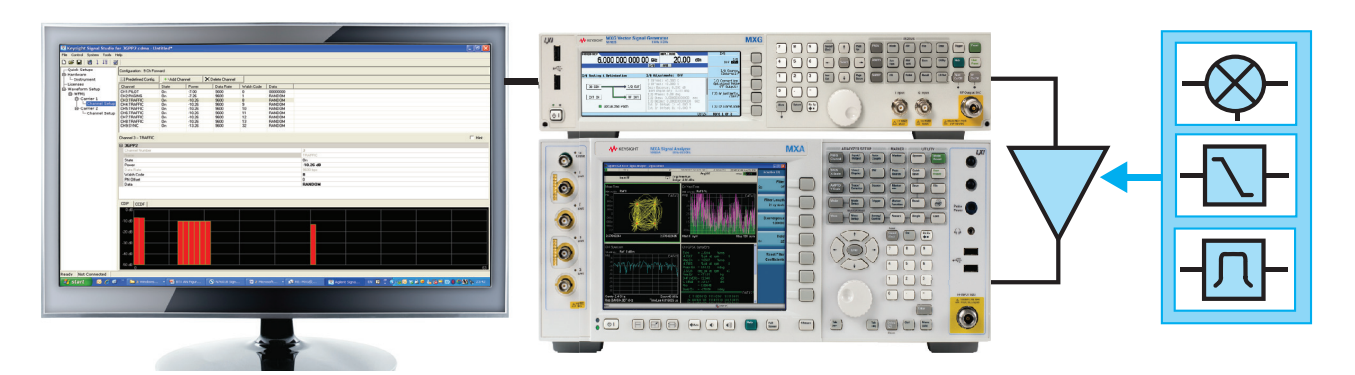
Figure 1. Typical component test configuration using Signal Studio's basic capabilities with a Keysight X-Series signal generator and an X-Series signal analyzer

The N7601B Signal Studio for cdma2000/1xEV-DO software's basic capabilities enable you to create waveforms with multiple and mixed carriers for component testing. With the purchase of the N7601B software's Basic CDMA license, the software generates waveforms in both the IS-95A and the cdma2000 radio formats. With the purchase of the N7601B software's Basic 1xEV-DO license, the software generates waveforms in both the 1xEV-DO Rev. 0 and 1xEV-DO Rev. A radio formats. Both Basic licenses allow the software to generate waveforms in all four radio formats.