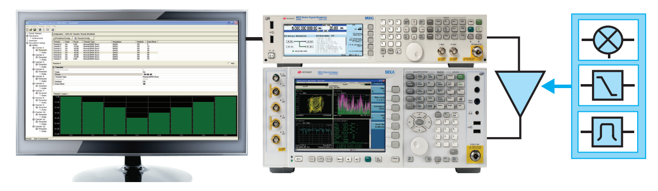
Figure 1. Typical component test configuration using Signal Studio's basic capabilities with a Keysight X-Series signal generator and an X-Series signal analyzer

Signal Studio for GSM/EDGE/Evo simplifies and accelerates the testing of standardsbased scenarios with included pre-defined signal configurations including single slot, all slots, uniform, and mixed-burst waveforms for GSM, EDGE, and EDGE Evolution, including all modulation formats and symbol rates.