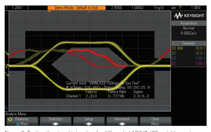
Figure 2. Testing the signal integrity of a differential ARINC 429 serial bus using eye-diagram mask testing.

The upper, lower, and middle regions that define the waveform "keep-out" area of the ARINC 429 mask shown in Figure 2 are based on published ARINC 429 minimum and maximum input amplitudes, rise/fall times, and clock tolerance specifications.