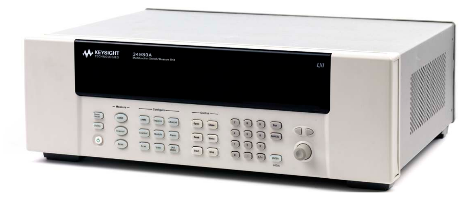
Figure 1. 34980A Multifunction Switch/Measure System

Four wire resistance measurements provide the highest accuracy by eliminating all internal path resistance and DUT lead resistance from the result. Typically, this requires two channels for each measurement. We offer an alternative technique, detailed in this application note, which eliminates the internal path resistance from PC board traces and additional relays in the measurement path.