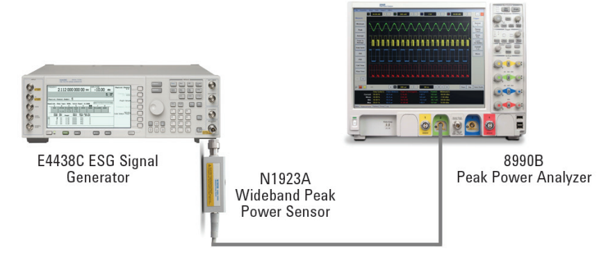
Figure 2. Typical setup diagram of droop measurement

Figure 2 illustrates the equipment configuration for droop measurement.