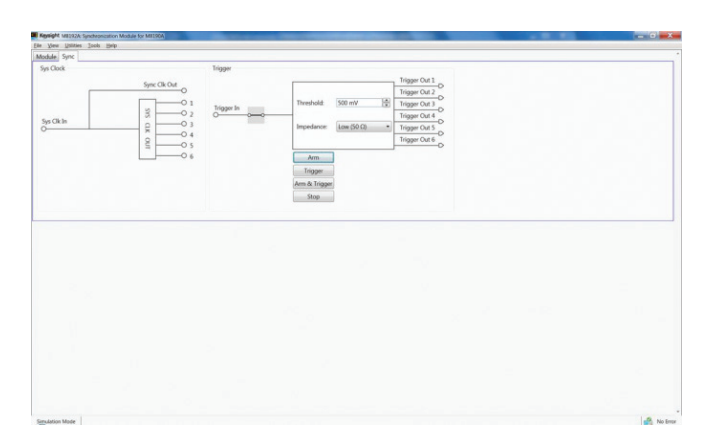
Clock and trigger distribution screen