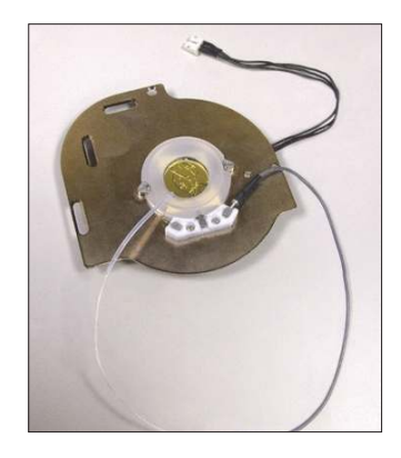
Microscope on glove box. Inset: sample plate with the mini reference electrode (Ag/AgCl).