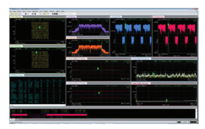
Figure 4. Keysight 89600 VSA software illustrating a 2-channel configuration with two streams at 80 MHz bandwidth.

For testing receivers, Keysight's M9381A VSG with Signal Studio software provides full support of 802.11ac standards-based signals. Signal Studio software is used to generate 802.11ac standard compliant waveforms including MIMO/MU-MIMO, MAC layer, ARB-based channel fading models, multi-frame and sequencer playback for PER/sensitivity tests. The M9381A VSG provides frequency coverage up to 6 GHz, support for 256 QAM, and RF modulation bandwidth up to 160 MHz with \pm 0.5 dB flatness. Keysight's 802.11ac MIMO test solution provides the accuracy, speed, flexibility and scalability required during research and development and design verification test of 802.11ac MIMO transmitters and receivers.