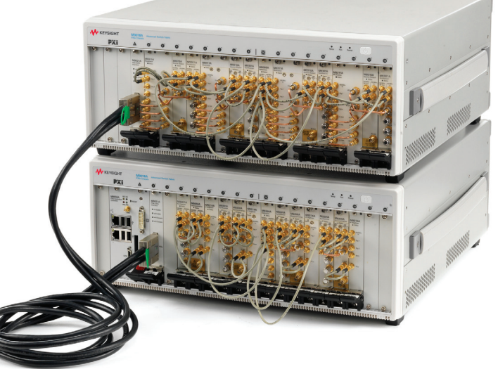
Figure 3. Measurement setup for 4x4 802.11 MIMO transmitter and receiver testing.