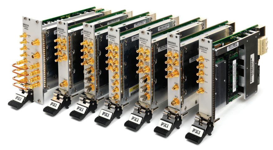
Figure 2. M9391A PXIe vector signal analyzer and M9381A PXIe vector signal generator modules.

Test systems must meet today's functional demands for 802.11ac, while maintaining backward compatibility to support 802.11n, and be flexible enough to support bandwidths up to 160 MHz.