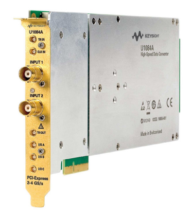
Figure 4. U1084A Acqiris PCIe digitizer

In summary, Keysight's data conversion technology has enabled the development of new molecular research techniques based on CP-FTmmW spectroscopy that allow researchers to make faster measurements at millimeter-wave frequencies than were previously possible with conventional spectroscopy techniques.