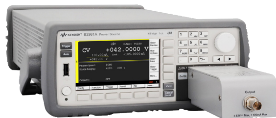
B2961A/62A power source with UNLF