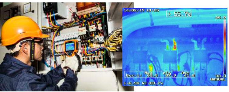
Predictive maintenance on electrical systems