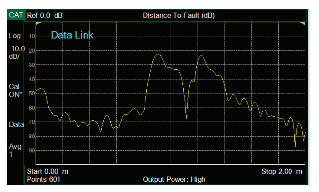
Use complimentary Data Link software to generate reports