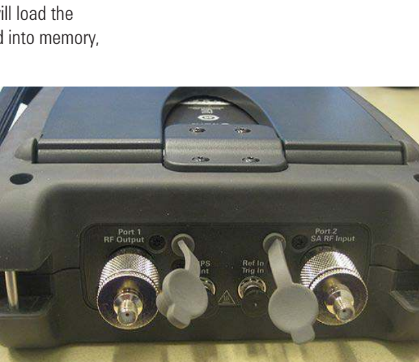
Figure 3. Top view of the FieldFox connection ports with the SMA adapters attached

Next in order of importance is the Measure button, also the number "1" key on the keypad. Pressing this button brings up a selection of pre-programmed measurement functions on the soft keys. In some cases the right most soft key provides a More/Back function for additional measurement functions. For example, for the CAT application, the Measure button will bring up the measurement functions of Distance-To-Fault (DTF) (dB), Return Loss & DTF, Return Loss (dB), VSWR, DTF (VSWR), Cable Loss (1-port), Insertion Loss (2-port), and DTF (Lin). One of the measurement options will always be selected, and that selection will appear in black background while the other choices remain in blue background. The default wake-up state for FieldFox is the CAT application with the Return Loss (dB) measurement function.