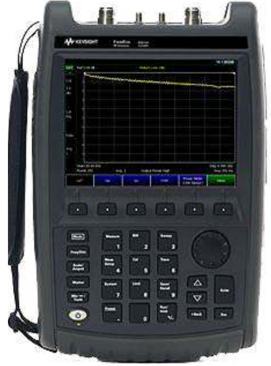
Figure 1. Front view of the Keysight FieldFox N9914A

The FieldFox is a battery-powered device to make it portable. The run time depends upon how the unit is being used, but generally about three hours can be expected from a full charge. If the FieldFox is being used in a lab, it is generally a good idea to plug it into the DC charger just to insure that the batteries do not run out during a lab session. The battery pack is a four-cell Li-ion cartridge which slides into the FieldFox through a cover slot on the lower right hand side of the instrument. For normal use, there is no need to access the battery. The battery is charged using the 15 Volt DC external power supply which plugs into a standard 120 VAC receptacle. The external power supply plugs into the FieldFox through the third rubber-sealed port from the top on the left side of the instrument. This is located right underneath the nylon carrying strap. When the battery is being charged, the power LED below the power button will slowly pulse yellow. Complete recharging of a spent battery usually takes about two hours. When FieldFox is running, the display will show a battery icon at the top of the screen with a set of bars which indicate the battery's charge status. Be aware that the battery may need to be recharged with only half of the bars still showing.