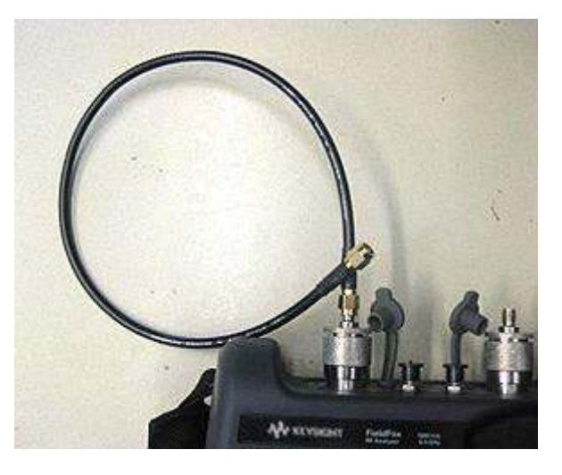
Figure 4. Connection of the RG58C/U coaxial cable to the FieldFox

This arises physically from the dielectric material of the cable becoming increasingly lossy with higher frequencies, so that waves propagating through the cable become attenuated in strength as they travel. As the incident wave makes one roundtrip transit through the cable, the cable loss reduces the amount of power that is reflected back into port 1. The ratio of the returned signal power relative to the power of the test signal is