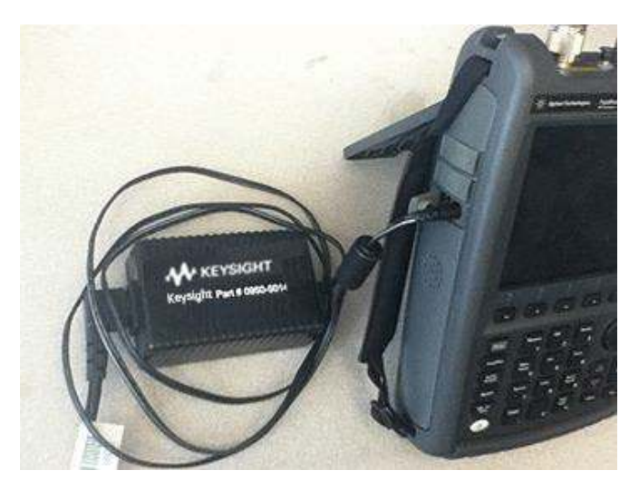
Figure 2. The FieldFox connected to its DC power supply