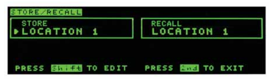
Figure 4. Selecting or recalling the store location can be done easily on the front panel of the 34450A.

For example, if your measurement requires multiple test points and each has different needs in terms of measurement functions, range, and resolution, you can dedicate a specific memory location to the test points. Whenever you need to measure the test point, you simply recall that specific memory location. The store and recall feature is supported in both local and remote modes.