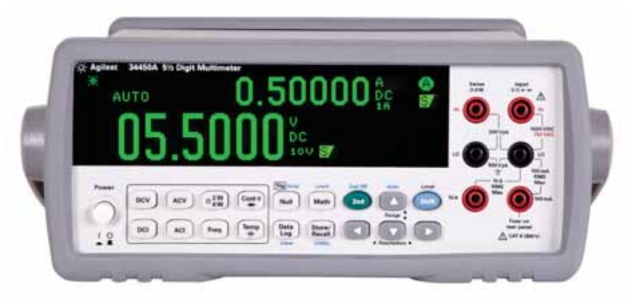
Figure 1. Dual display measurements on 34450A.

The 34450A has a high speed analog-to-digital converter (ADC) that takes samples from the input terminals. When using the 34450A's dual display measurement feature, the internal circuitry switches between making primary and secondary measurements so that the ADC takes samples for both measurements. This eliminates the need for a dual ADC, and thus reduces the price of the DMM.