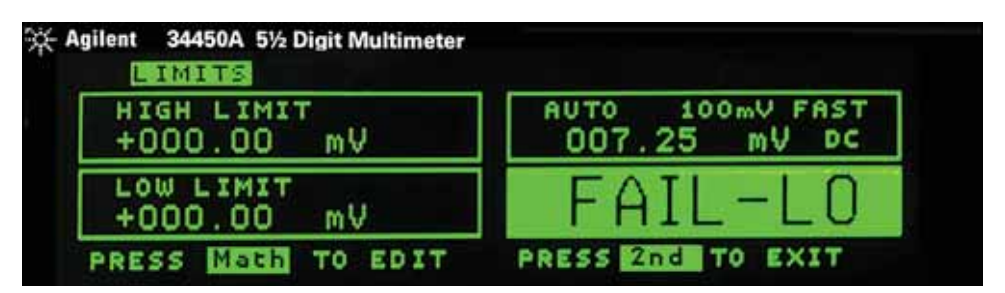
Figure 5. The display of 34450A in limit operation.

Limit operation is extremely useful for manual operations. There are many simple and low cost production tests require only one DMM to perform a specific test. For example, measuring the voltage across an LED to determine whether it is within its tolerance can be done easily using the limit test function of the 34450A. The 34450A displays "PASS", "FAIL-LO" or "FAIL-HI" based on the limits set. Apart from displaying the measurement value with a pass or fail identification, the 34450A beeps to alert the operator when a measured value falls outside the set limits. You can put the 34450A into the limit operation by pressing [Shift] > [Math].