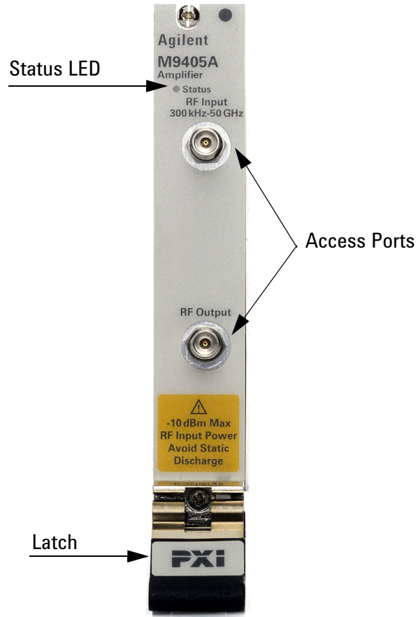
Figure 2 M9405A Front Panel