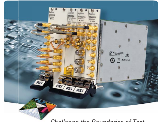
Challenge the Boundaries of Test Agilent Modular Products