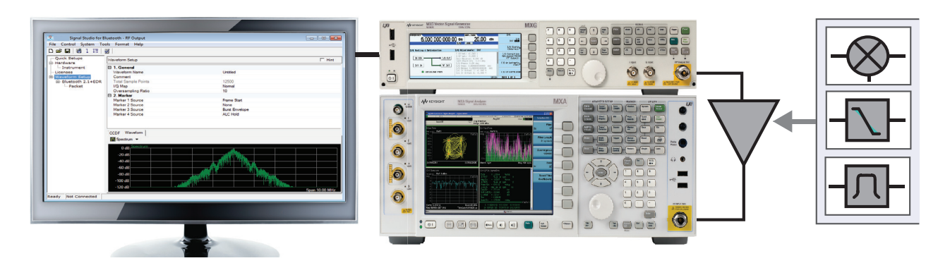
Figure 1. Typical component test configuration using Signal Studio's basic capabilities with a Keysight X-Series signal generator and an X-Series signal analyzer.

Signal Studio's advanced capabilities enable you to create and customize FM Stereo/RDS or DAB/DAB+/T-DMB waveforms to characterize the power and modulation performance of your components and transmitters. Easy manipulation of a variety of signal parameters, including transmission bandwidth, cyclic prefix, and modulation type, simplifies signal creation.