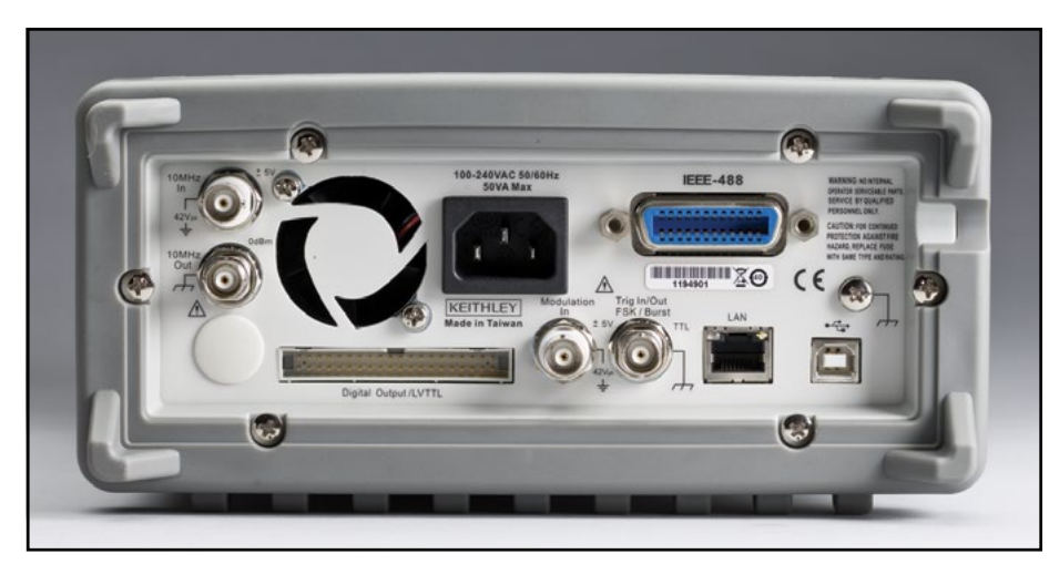
Model 3390 rear panel

The Model 3390 supports the physical, programmable, LAN, and Web portions of the emerging LAN eXtensions for Instrumentation (LXI) standard. The instrument can be monitored and controlled from any location on the LAN network via its LXI Web page.