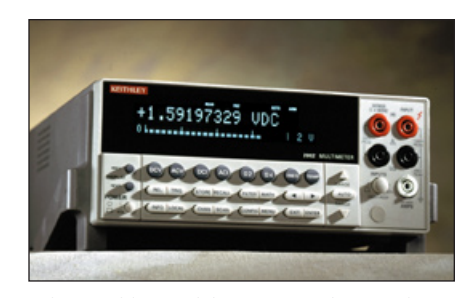
This Keithley Model 2002 DMM has 8½-digit resolution and can approach theoretical limits for sensitivity.