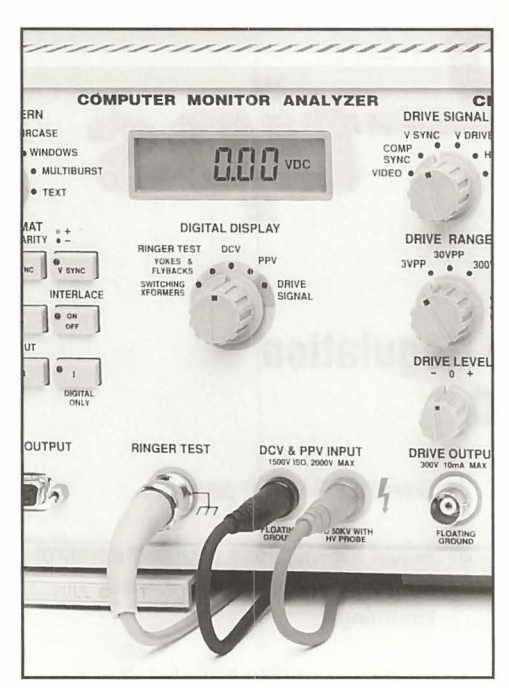
Fig. 2: Use the Digital Display functions to measure the DCV and PPV at the horizontal output transistor.

as the display brightness changed. On a typical monitor, however, the raster size increases as much as twice the width of the border line in all directions as the raster is switched from black to white. Any raster size increase greater than this indicates a problem with the monitor.