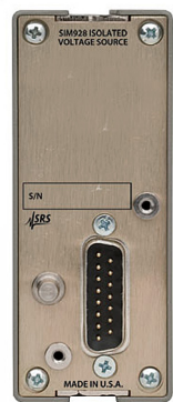
SIM928 rear panel