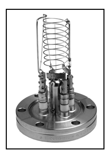
Figure E-2. Nude Bayard-Alpert gauge, with standard electrode design.

Nude BAGs are more expensive than glass-tubulated designs. When connected to a suitable controller, they provide pressure readings between 10<sup>-3</sup> and 4x10<sup>-10</sup> Torr (typical X-ray limit), with extended UHV versions reaching a 2x10<sup>-11</sup> Torr low limit. Typical sensitivities fall in the range of 8-10 Torr<sup>-1</sup> for standard gauges and 25 Torr<sup>-1</sup> for the extended UHV versions. Extended UHV versions are easily identified by the fragile 'squirrel-cage' design (i.e. closed ends) of their anode grid.