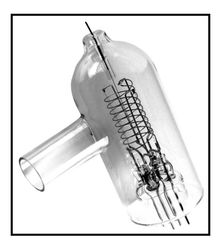
Figure E-1. Glass tubulated Bayard-Alpert ionization gauge, with glass side tube.

The tubulated gauge has its electrodes surrounded by a glass envelope with a side tube that attaches to the vacuum system. The most common construction materials for the glass envelope are Nonex (an inexpensive glass used in old vacuum tubes) and Pyrex. Most tubulated BAGs are connected to the vacuum system through an O-ring compression fitting. Pyrex is the material selected when the side tube must be glass-blown directly on to the vacuum system. Kovar alloy is the material of choice when metallic tubulation is required for the side port. The thermal expansion coefficient of Kovar matches that of Pyrex producing strong glass-to-metal transitions. Kovar tubulation is sometimes combined with compression fittings, but most often it is welded to Klein or ConFlat® flanges for compatibility with standard vacuum ports. While slightly more expensive, flanged tubulated BAGs offer better vacuum integrity and higher bakeout temperatures than compression fitting options. Side tube diameters are set by standard compression fitting diameters to ½", ¾" and 1" OD. Whenever possible, choose the widest possible bore to assure structural integrity and maximum gas conductance between the vacuum chamber and the BAG ionization region.