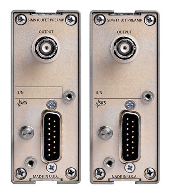
SIM910 & SIM911 rear panels