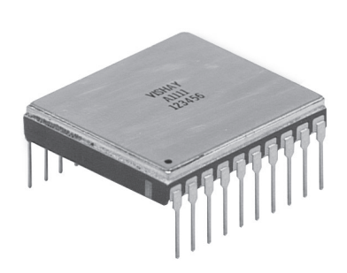
Product may not be to scale

The 20 pin 1 inch x 1 inch side brazed ceramic package is a good choice for a variety of applications. The footprint of this package is frequently used in metal enclosures and open face circuitry as well as the side brazed ceramic package offered by Vishay. Select Model 1476 for lower profile and additional pins. This network can contain up to 221 V5X5 resistor chips.