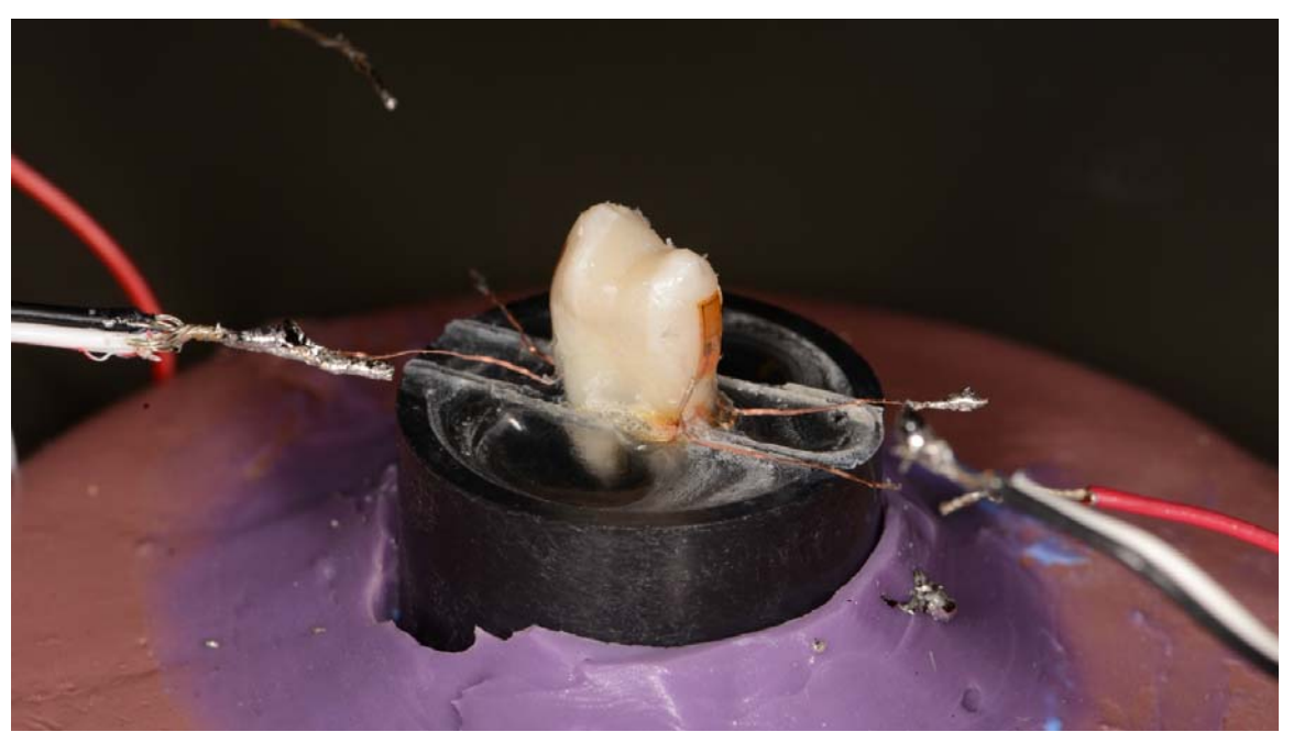
Figure 2: Maxillary premolar mounted in a phenolic ring with Micro-Measurements model EA-06-062AP-120/LE strain gages bonded.