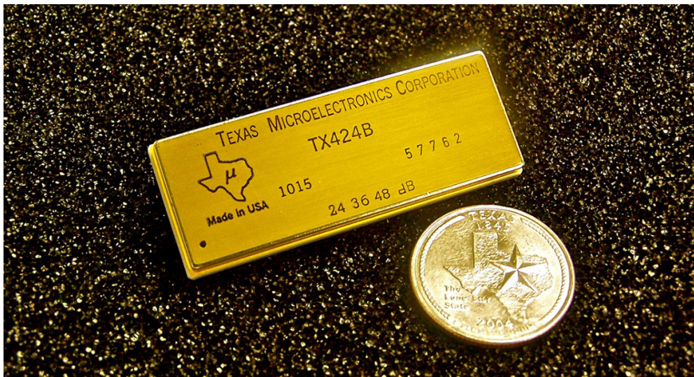
Figure 2: TX424 in size comparison

The V5X5 Bulk Metal Foil resistor chips from Vishay Foil Resistors provide the overall stability and reliability for the TX424 precision analog to digital converter.