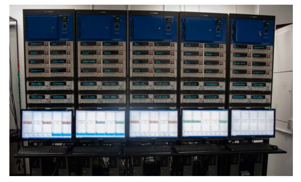
Figure 3: The Dalhousie UHPC