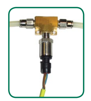
Air Pressure Transducer