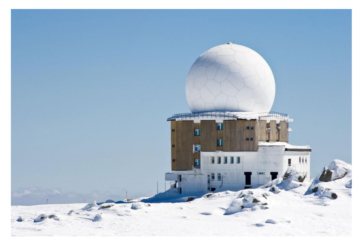
Figure 1 - Weather stations represent a prime example of a resistor application requiring the utmost in reliability and performance

such equipment must withstand the challenges of extreme environmental and operational stresses, and the resistors in particular must operate uniformly and reliably.