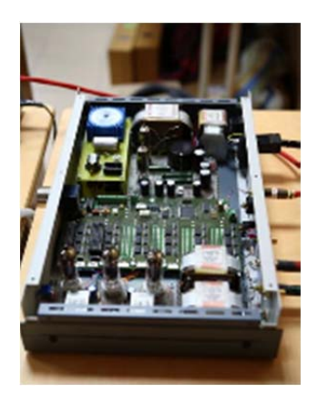
Fig. 2: The 3 way TOTALDAC board uses 288 of these resistors.

Once the prototype worked as expected I contacted Vishay Foil Resistors Europe to choose the most appropriate Bulk Metal Foil resistors. While the <u>VAR</u> series resistors – components specifically designed for audio applications – may have been the absolute ideal resistors to be used, the VSR series through-hole resistors offered sufficiently impressive performance combined with a preferred price tag. That is of particular interest due to the high number of resistors used per channel. To my knowledge, no other DAC for the high-end audio market uses a 24-bit foil ladder configuration. The Bulk Metal Foil resistive technology is the absolute key factor for the success of this design.