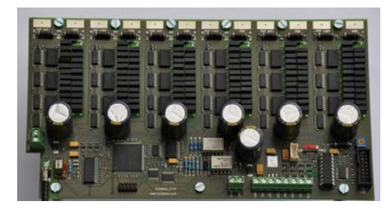
Fig. 1: Each channel uses 96 pieces of Vishay Foil Resistors' VSRJ 0.01% Bulk Metal Foil resistors

filters available. I also listened to many new DAC chips from TI and Analog Device in particular. These usually required microcontroller programming. The sound was often a bit metallic. Lastly I listened to the sound quality from a discrete R2R DAC made of simple 1% resistors. The musicality was there but some accuracy was missing. This was the starting point of my ultimate DAC solution. After two years, five PCB revisions, and other improvements to the FPGA, I finally settled on Vishay Foil Resistors' VSRJ 0.01% resistor. Although 96 discrete resistors per channel are used, the signal path is actually very short, going through the 0.01% resistors, into a C-L-C filter, through a capacitor, and then into the potentiometer.