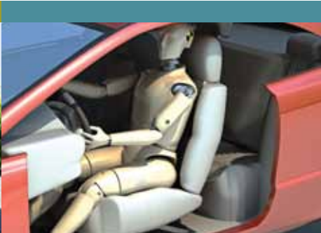
Strain gages and instrumentation for precision measurements in crash testing