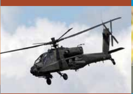
Bulk Metal® Foil resistors deliver high reliability, ultra-high precision, and long-term stability in demanding military, avionics and space applications