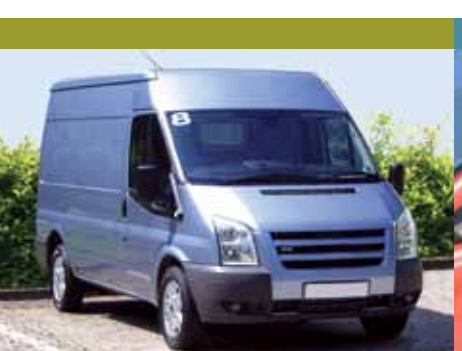
Axle overload protection systems for light commercial vehicles improve operating efficiency and safety

measurements to the most complex applications. Our design teams work closely with you in almost any location in the world to provide customized load cells and instrumentation that meet your requirements.